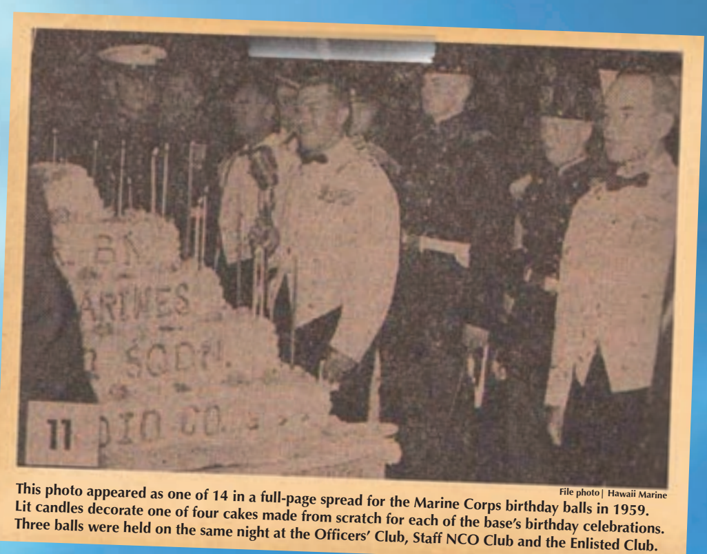
This photo appeared as one of 14 in a full-page spread for the Marine Corps birthday balls in 1959. Lit candles decorate one of four cakes made from scratch for each of the base's birthday celebrations. Three balls were held on the same night at the Officers' Club, Staff NCO Club and the Enlisted Club.

"I can assure you, I will still stand proudly as the 'Marine Corps Hymn' is played — as I did in 1959," he said. "I will still be filled with the same feeling of esprit de corps as I was at my first ball at Parris Island, South Carolina in 1950. As a Marine, this never leaves you."